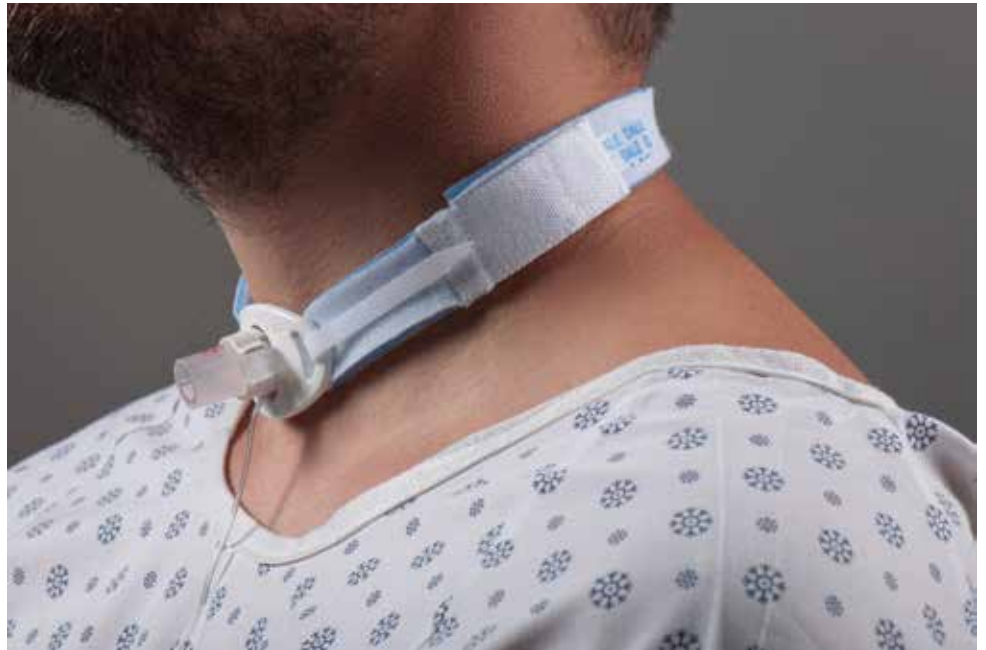
Figure 1. Example of Adjustable Tracheostomy Holder

Skin cleansing is done under the tracheostomy faceplate including under trach securing device and frequent changing of moist or soiled faceplate dressings. A standard procedure for management of tracheostomy sutures is in place. Observe for faceplate suture skin irritation and collaborate with surgeons to remove faceplate sutures at a specified protocol time-line. Observe for faceplate suture skin irritation and collaborate