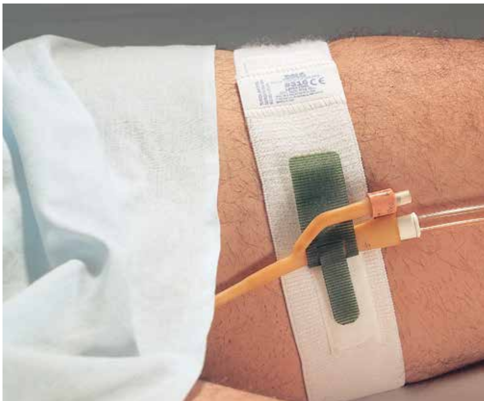
Figure 1 Example of Velcro® Locking Urinary Catheter Securement Device.

Using catheter securement to assist with prevention of device related pressure ulcers has only recently gained attention in evidence based guidelines. For the first time, a recently published International guideline for pressure ulcer prevention has a section on medical device related pressure ulcer. It clearly states that patients with medical devices should be considered at risk for pressure ulcers. 5 The incidence of device-related pressure ulcers nationwide is unknown. In 2010, 26% of full-thickness hospital-acquired pressure ulcers in Minnesota hospitals were reported to be related to medical devices 22 (MDH, 2010). Individual hospitals and organizations report medi-