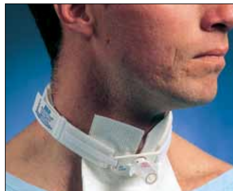
Figure 2. Tracheostomy tube holder: Padded neck band circles the neck. Velcro-type tabs hold the neck band to the tracheostomy tube.

A 2004 evidence-based guideline 19 for the prevention of ventilator-associated pneumonia (VAP) did not recommend